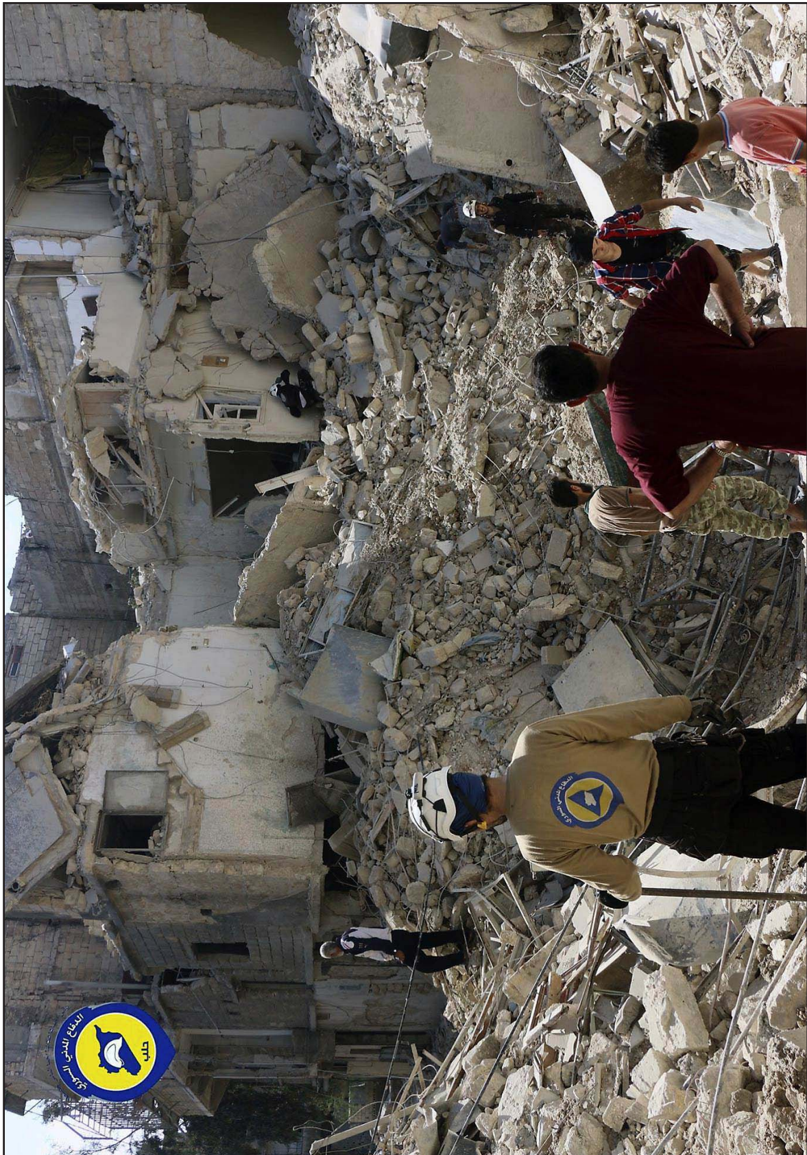
Syrian Civil Defense workers search through the rubble in rebel-held eastern Aleppo on October 11, 2016.