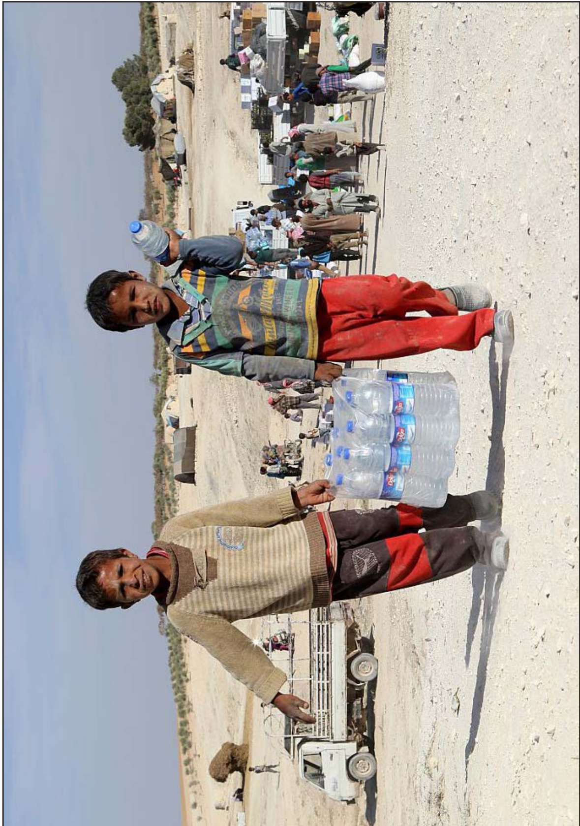
Children carry aid packages at a new village that was established near Sajur River by Syrian civilians escaping from a village south of Aleppo, Syria on October 19, 2016.